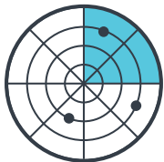
CleverClean™ scanner for maximum coverage