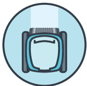
Single active scrubber