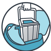
Top load filter